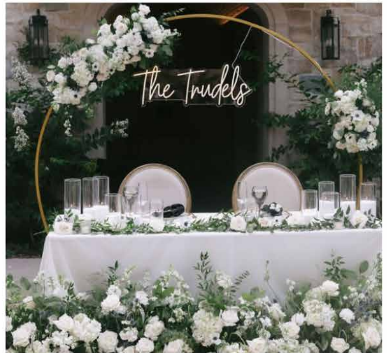
Circle Arch $180