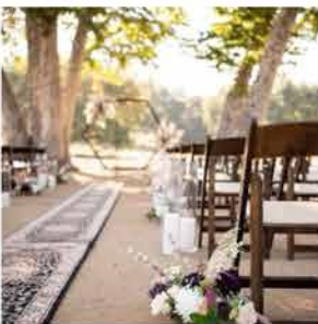
Fruitwood Chairs $6