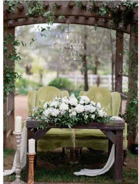
Vintage Velvet Olive High Backed Chairs $90 each