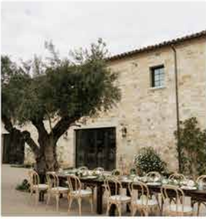
8ft Farmhouse Tables $99