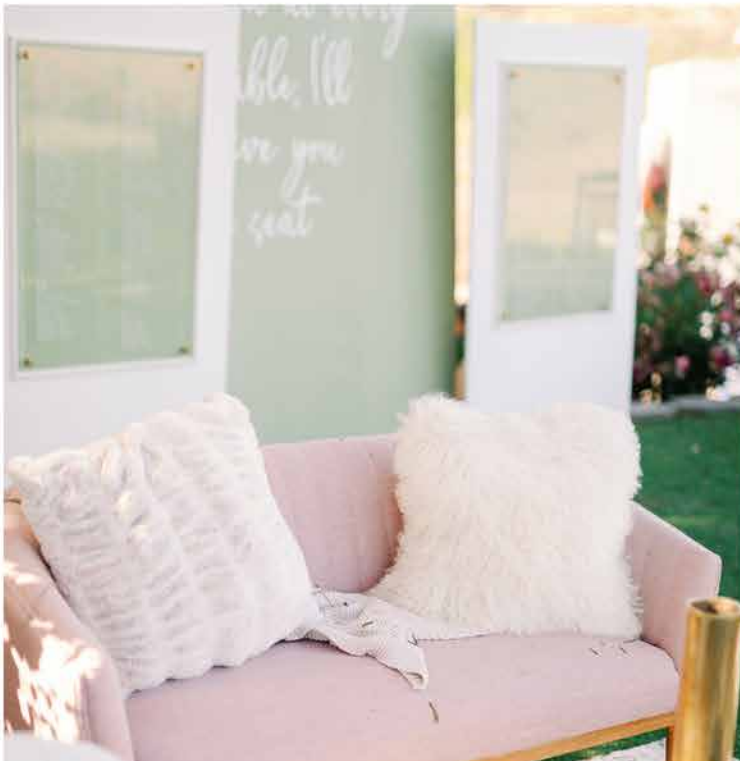
Pink Couch $199