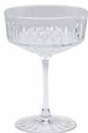
Ribbed Coupe Glass