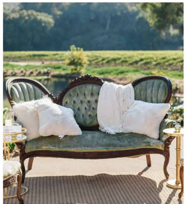
Sage Velvert/Wood Vintage Couch $550