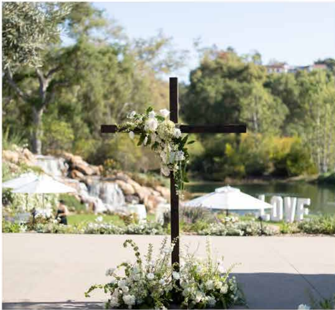
Wood Cross $220