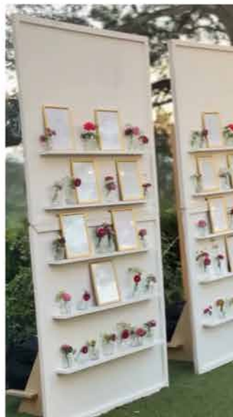
White Shelf Wall $220 each. Custom vinyl lettering available