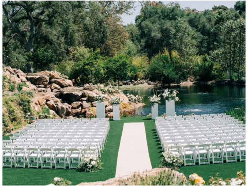
75 ft Runner by 4ft wide $340