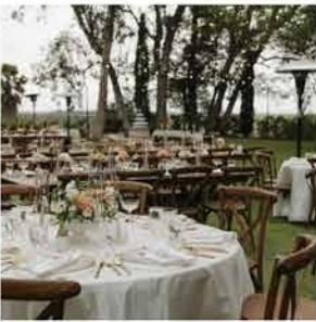
60" Round Tables $25 Linens start at $35