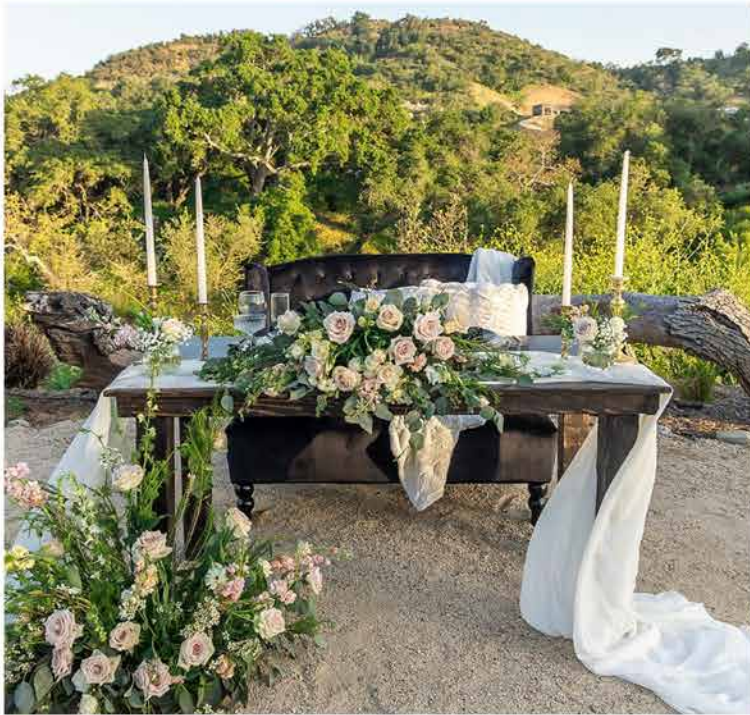
Black Settee $150