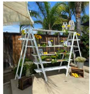
Ladder Shelves $150