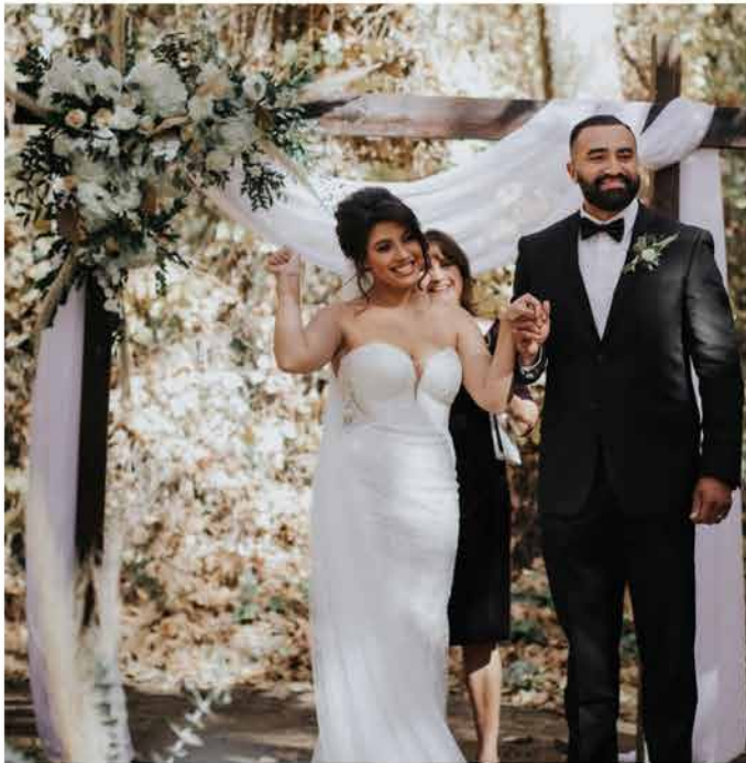
Open Wood Classic Arch $220