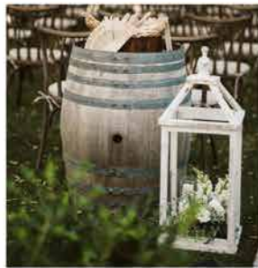
Wine Barrels $60 White 3ft Open Lantern $40