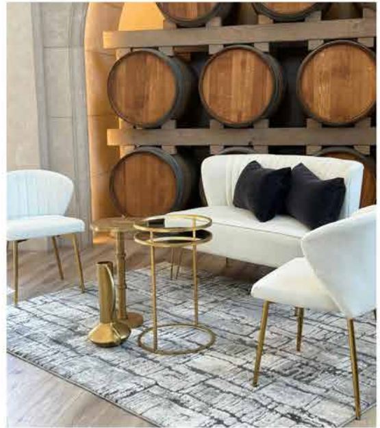
Ivory Velvet Lounge Set $750