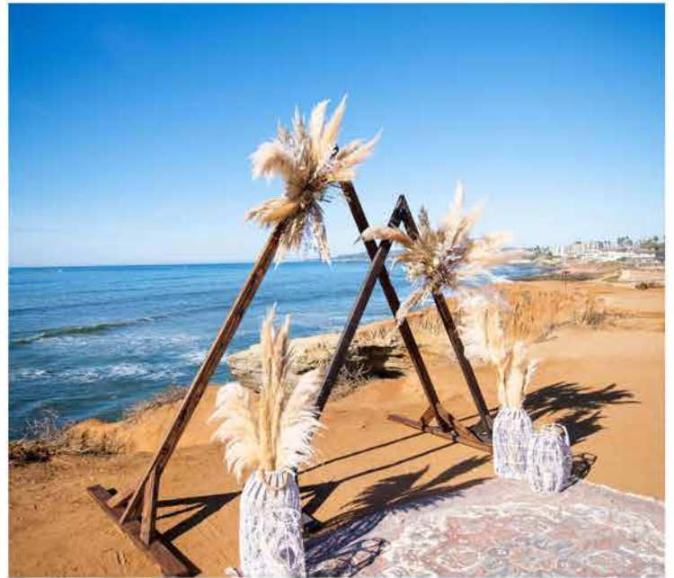
Double Tee Pee $280