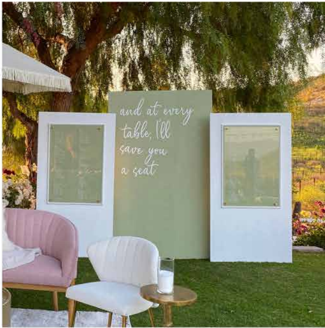
Sage Seating Chart 7ft by 4ft center Two side pannels 6ft by 3 1/2 ft $320