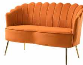
Velvet Terra Cotta Loveseat $199