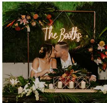
Copper 6ft by 4ft Backdrop (clients hang seating chart off of this or signage) $70