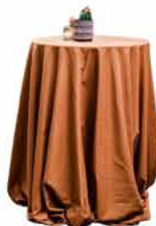
Cocktail Tables for Linen $20 Table Linen 120" $35