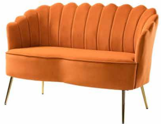
Terra Cotta Lounge (pairs with many side chairs, rugs etc.)