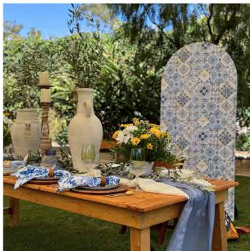
Mediterranean Backdrop $150