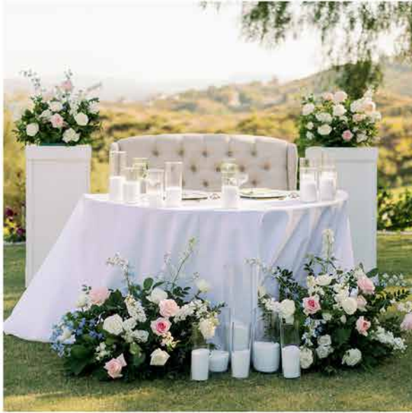
Tufted Ivory Setee $150