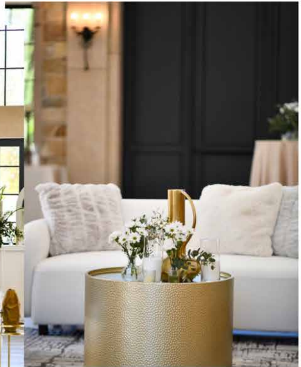
XI Lush White Couch Set with side chairs $890 each set

We have two matching sets, perfect for large spaces