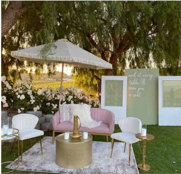
Blush and White $750