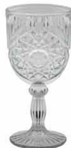
Vintage Mix of Clear Cut Glass