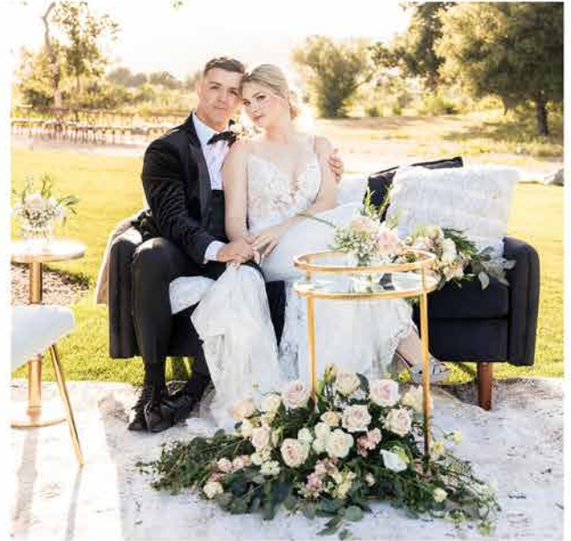
Modern Black Velvet $750