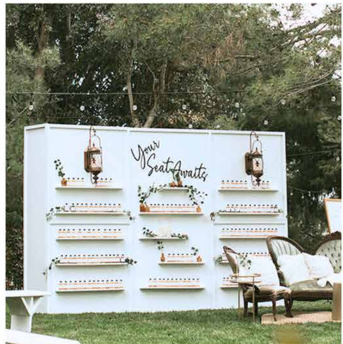
12ft wide x 8ft tall shelf wall with lanterns and sides $950