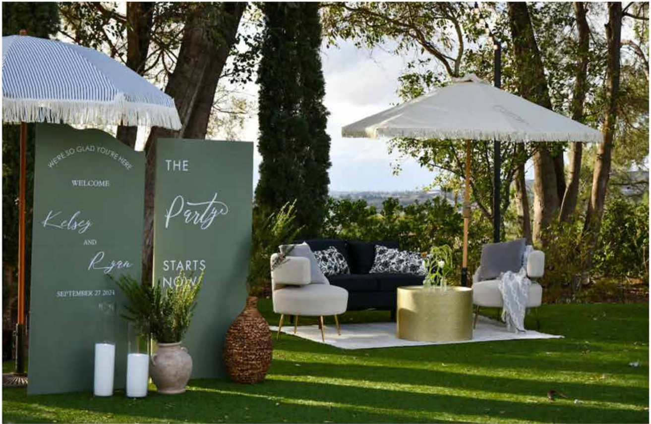
Black and White Lounge Set $750