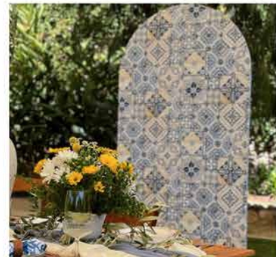
Mediterranean Tile Backdrop $150