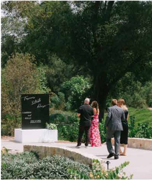
7ft by 4ft wall with 5ft base $250 (Custom wording is additional fee, use as seating chart or welcome sign)