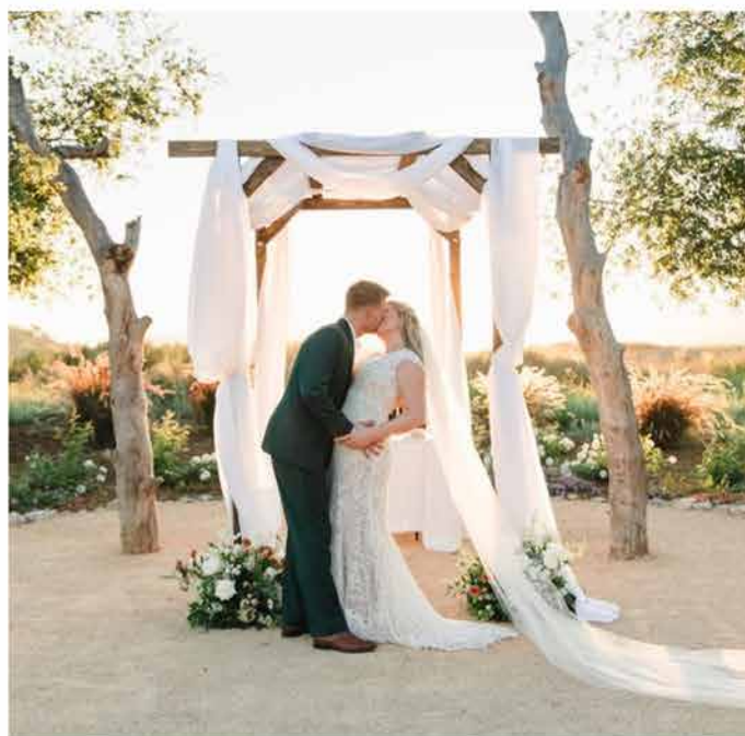
Chuppa $390 Linen not Included