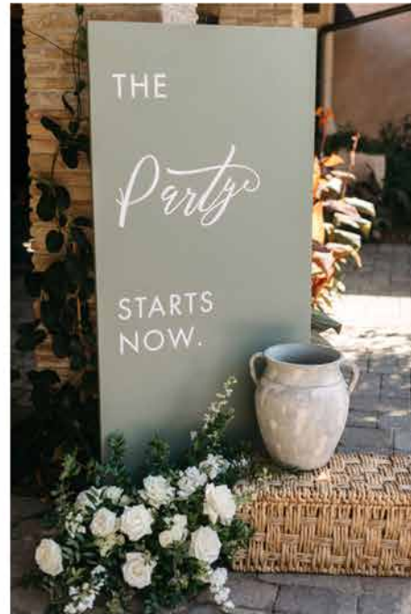
"The Party Starts Now." sage sign $150