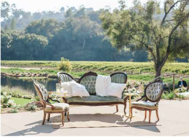
Vintage Sage Lounge $750