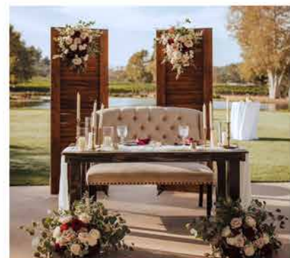
Louver Doors $150 Set