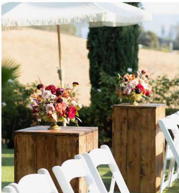
Natural Wood Floral Boxes 3ft $80 each