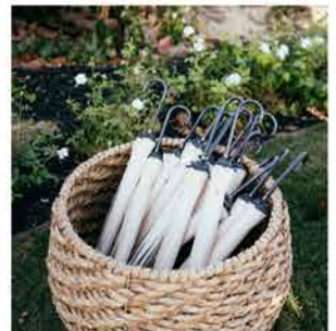
XL Baskets $35 each