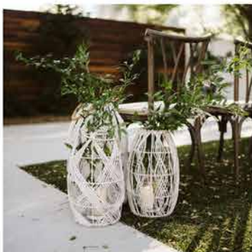
Woven Basket Lanterns $25