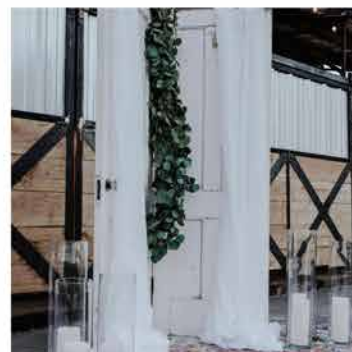
Vintage Double Doors $150