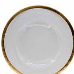
Clear Alpine Glass/Gold +$3.50