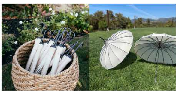
French Style Canvas Umbrellas in Basket display $125