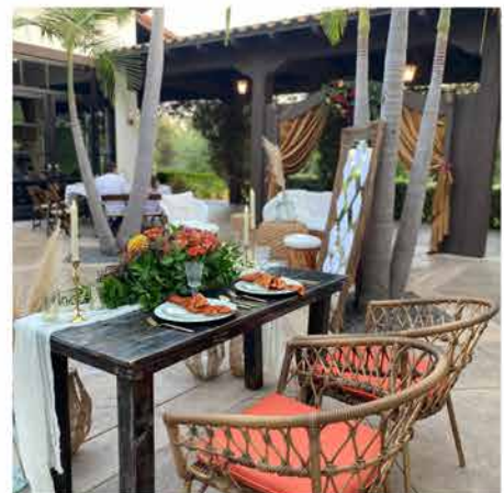
Wicker Chairs w/ Cushions Terra Cotta or Ivory $49 each