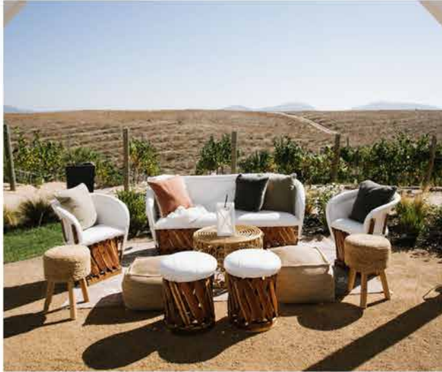
Hacienda Leather Lounge $890