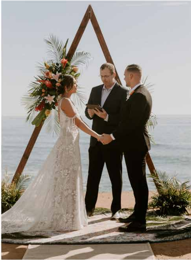
Tee Pee $180