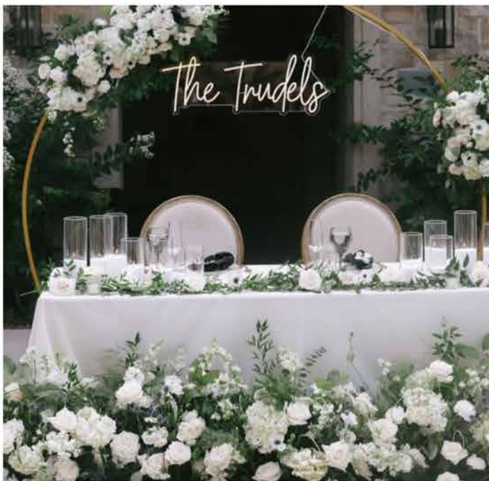
Cream Round Backed Sweetheart Chairs $49 each