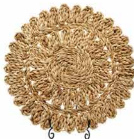
Woven Rattan +$1.50