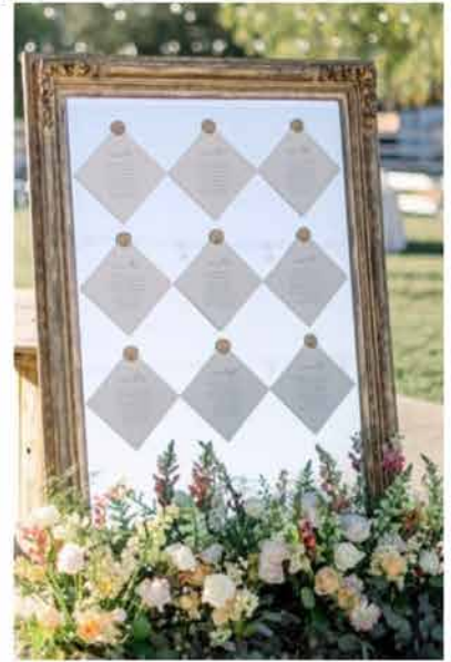
Vintage Gold Mirror $199 6ft by 4ft