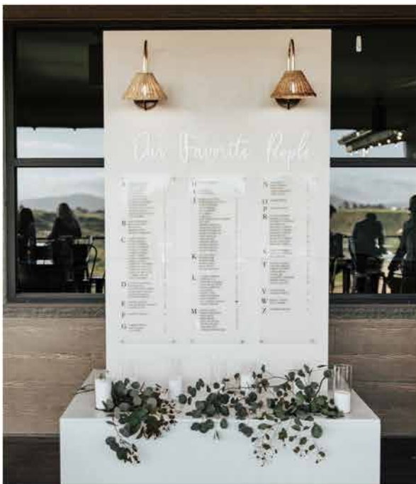
8ft by 4ft wall 5ft base $390