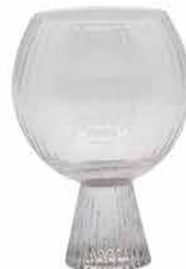
Ribbed Lowball Crystal