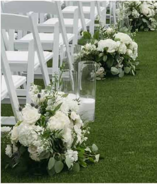
XL Wax Candles 2 1/2ft varying height cylinders $20