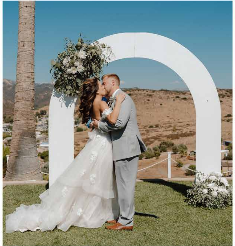
White Arch $280