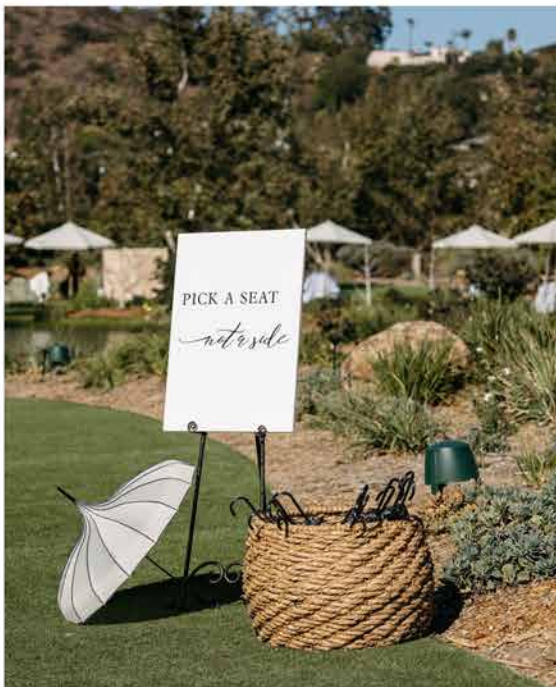
"Pick A Seat Not A Side" sign with easel $100