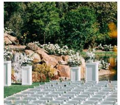
Floral Stands 3ft $80, 4ft $90