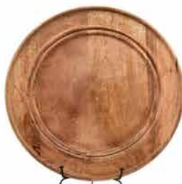
Mango Wood +$3.50