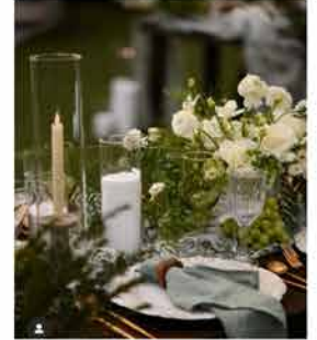
Farmhouse Sweetheart Table $69