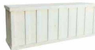
8ft White Bar Shelving underneath $350