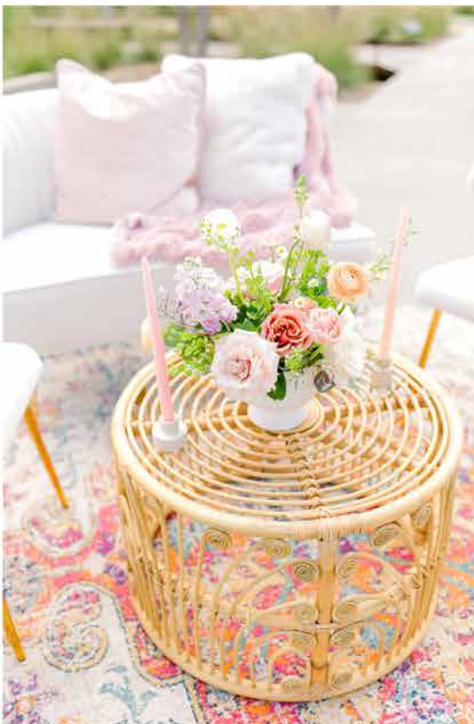
Ivory Lounge Set $750

We can mix and match from our large inventory of sofas, loveseats, rugs, pillows, throw blankets, side chairs, coffee tables or side tables to offer you an amazing look to match your style. Call us at (951) 551-4517 to get started!