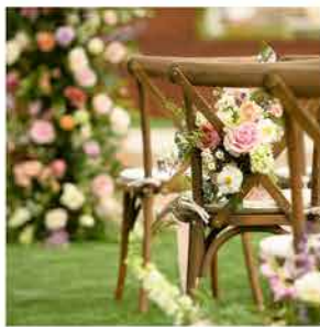
Light Oak Crossbacks $12 Cushions $2