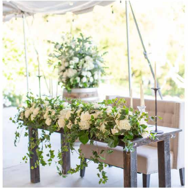
Ivory Squared Edges settee $150