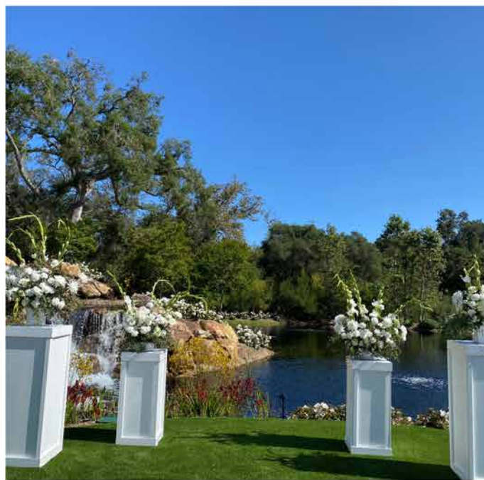
White Floral Boxes 3ft $80 Each 4ft $90 Each