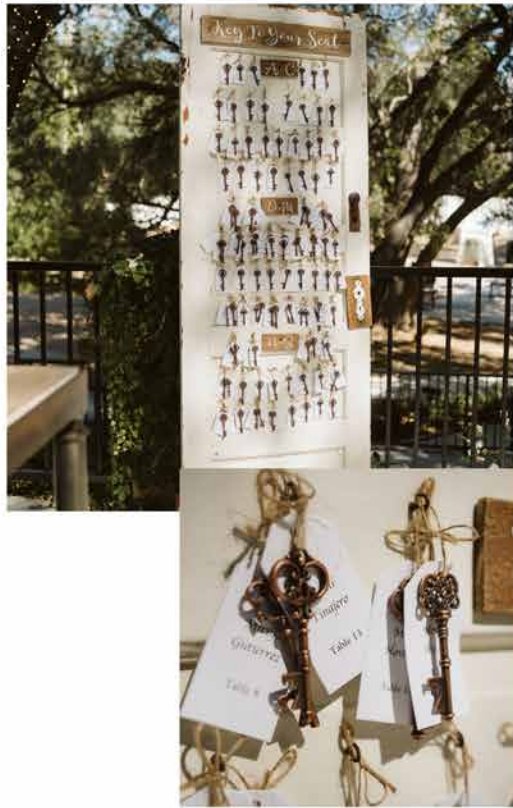
Vintage Door "Key to your seat" $150