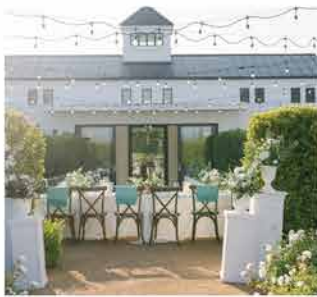
Folding Banquet Tables 6 ft by 30 inch $25 8 ft by 60 inch $25