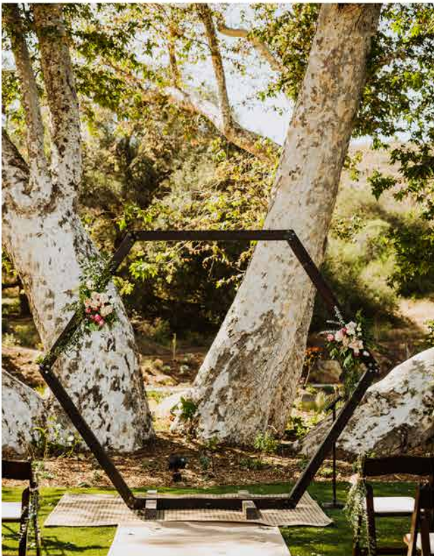
Wood Hexagon $280