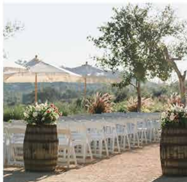
Ceremony Umbrellas $80 (includes base) Wine Barrels $60