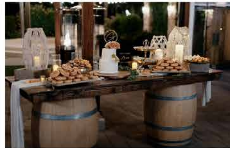
8ft Wine Barrel Table/Bar $220