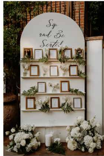
"Sip and Be Seated" Seating Chart $220