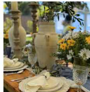
XL Clay Pots Neutral whites, creams Varying size 2 1/2-3ft $45 each