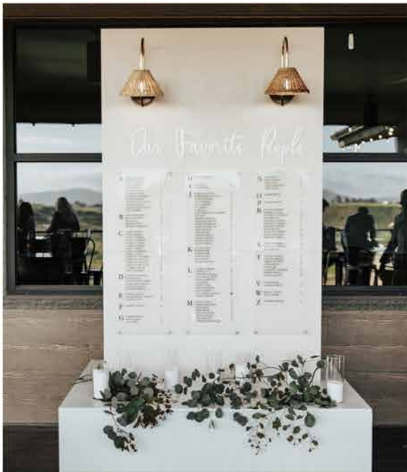
8ft by 4ft wall 5ft base $390