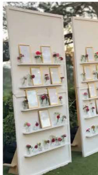
White Shelf Wall $220 each. Custom vinyl lettering available