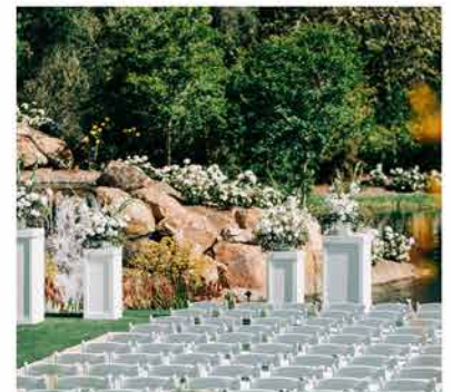
Floral Stands 3ft $80, 4ft $90