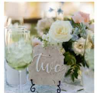
Table Numbers $35